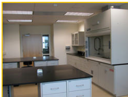
The Innovation Center's 500-square-foot lab suites are available with or without fume hoods for working with hazardous chemicals.

The program came to fruition when the incubator struck a deal with Sigma-Aldrich, an international life-science product supplier. Under the agreement, the Innovation Center provided a secure room, a locking cabinet, utilities and Internet access; Sigma-Aldrich handled all invoicing and provided the stock, the personnel and the equipment: a refrigerator, a freezer,