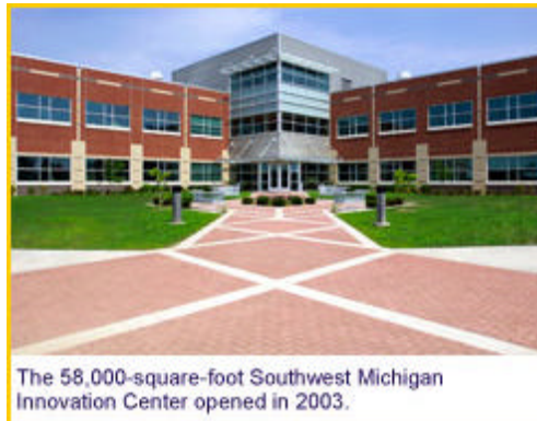
The 58,000-square-foot Southwest Michigan Innovation Center opened in 2003.

on-site storeroom with a variety of research supplies to give clients a convenient, low-cost alternative to maintaining their own inventories. By reducing the amount of standard scientific supplies clients need to store, the program allows clients to fill their labs with the equipment and researchers they need to grow their firms.